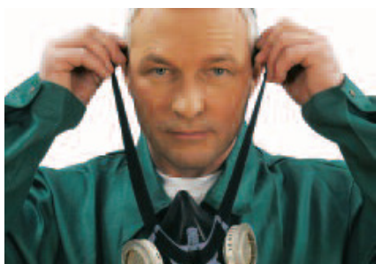
Place cradle on head