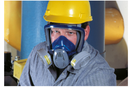
Advantage 3200 with Advantage chemical cartridges

The Advantage filter lines are for use with Advantage 3200, Advantage 200 LS and Advantage 420.