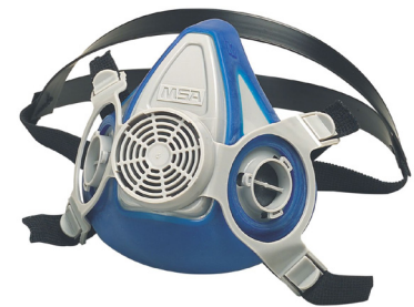
Advantage 200 LS half mask

The Advantage 200 LS is a comfortable, efficient and economic half mask. It is ideal for applications where workers are exposed to various hazards from job to job, such as high concentrations of fumes, mists and gases.