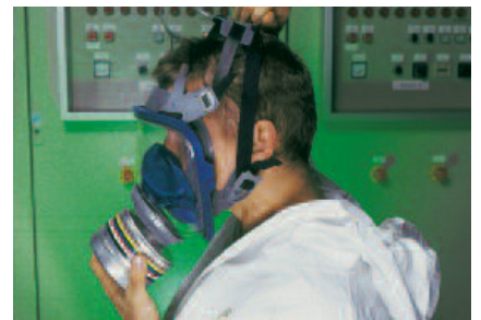
Pull the harness over your head