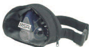
Pouch for Advantage 200 LS

Note: Filter weight limit for Advantage 410 = 300 g