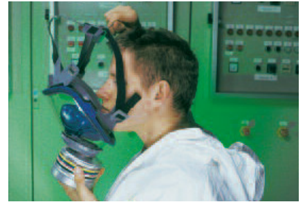
Put your chin into the chin cup