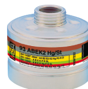
Combination Filter 93 ABEK2-Hg/St