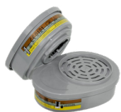
Advantage 201 Chemical Filter A2B2E1