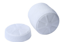
Pre-Filter for Filter Cartridge