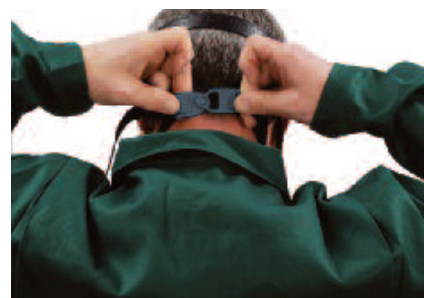
Close neck buckles and pull on both straps evenly