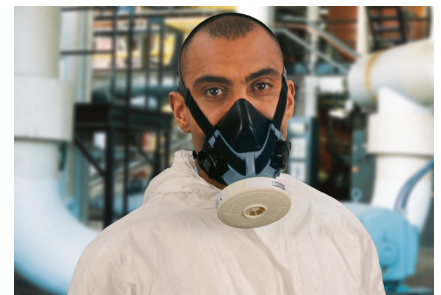
Advantage 410 with P3 PlexTec filter

For detailed information on standard thread filters please see leaflet 05-100.2.