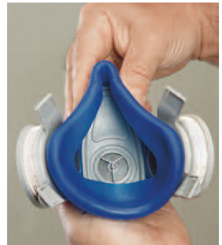
Facepiece-to face Anthrocurve