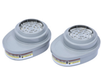
Advantage 200 Particle Filter P3