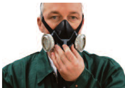
Pull down front straps and lock lever