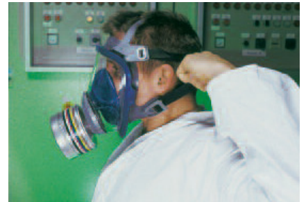
Tighten the two lower straps

The full face mask series Advantage 3000 provides both protection and unparalleled comfort. The soft sealing line made of hypo allergenic silicone provides a pressure-free fit. The large, optically corrected lens ensures a clear, undistorted view, while the grey-blue colour gives the mask an aesthetic appearance.